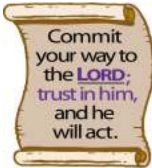
Psalm 37:5. NRSV